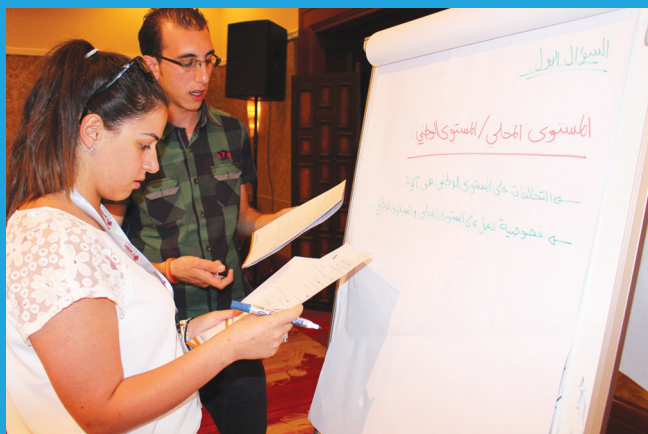
Group discussing the importance of building alliances between the different civil society organizations

Volunteerism was highlighted in most of the dialogues. There was consensus on the added value of awareness and engagement at a young age, which leads to a more dynamic civil society in the sustainable future. Participants, therefore, referred to volunteerism as ‘positive civic engagement’.