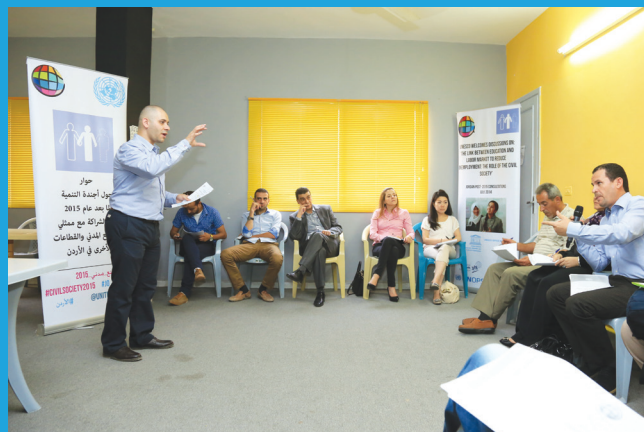
Participants debating education and employability in the Northern Governorate of Irbid

As highlighted during the discussions, national institutions should harness the benefits of youth engagement in the implementation of the Post-2015 Agenda, and should therefore invest more in this valuable group. Through civic engagement, young people can direct their energy and creativity towards discovering innovative solutions to critical development issues. Investing in youth and volunteerism encompasses strengthening youth skills, encouraging them to engage in meaningful activities and supporting them in having their voices heard.