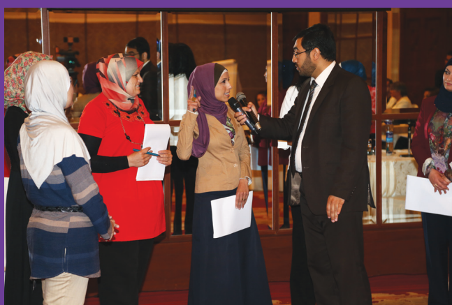
NGO representatives interactively presenting their ideas for a more participatory approach to monitoring development progress

This suggestion envisages the creation of an online platform/ website by the Government of Jordan with regular (e.g. quarterly) updates provided on the progress towards the achievements of the Post-2015 targets. The website would also have a space for citizens’ comments and suggestions.