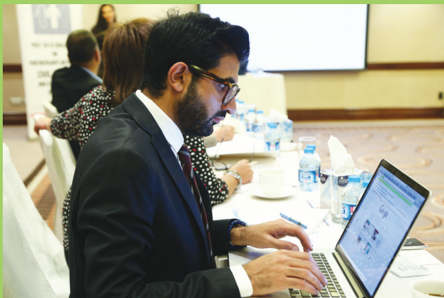
NGO representatives highlighting the important role of social media in the implementation of the Post-2015 Agenda

CSOs are at the heart of local communities; the majority have established strong trusting relations with these communities and have proven the credibility of their actions. Implementation of projects and initiatives is a key strength of CSOs as they deal directly with people. They have been successful in making things happen on the ground, and their light bureaucracy allows a faster, more targeted response than that of national institutions.