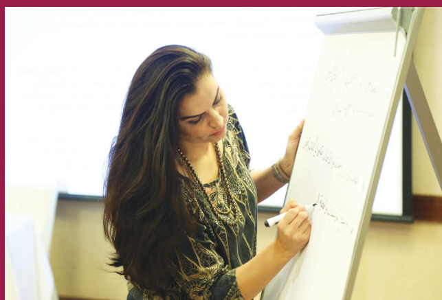
Participant summarizing the key outcomes and recommendations of the discussions

Within the consultations, representatives from the Government and the civil society agreed on the importance of research studies and assessment reports to inform and guide policy making. However, the challenge within this lies in the way these documents are submitted for the consideration of national institutions. Participants suggested the development of periodical analysis reports that shed light on lessons learnt and suggestions to move forward on issues of particular relevance at the national or local level.